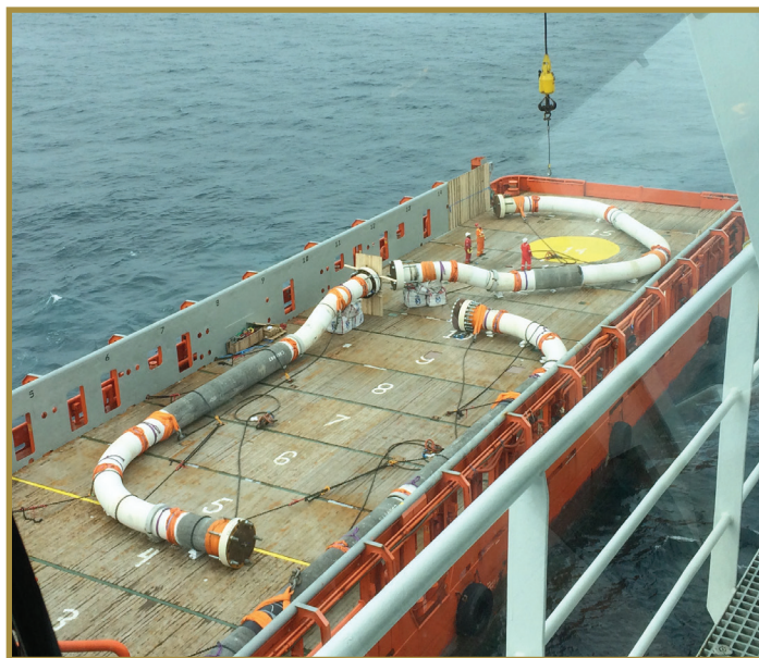
36" metrology spools used to tie-in SSIV

With subsea construction completed, the newly made-up flange joints were locally leak-tested at each gasket to provide initial confirmation of the joint integrity. This then allowed the pipeline pressure to be equalised behind the isolating Tecno Plug and the seals and locks were actively unset.