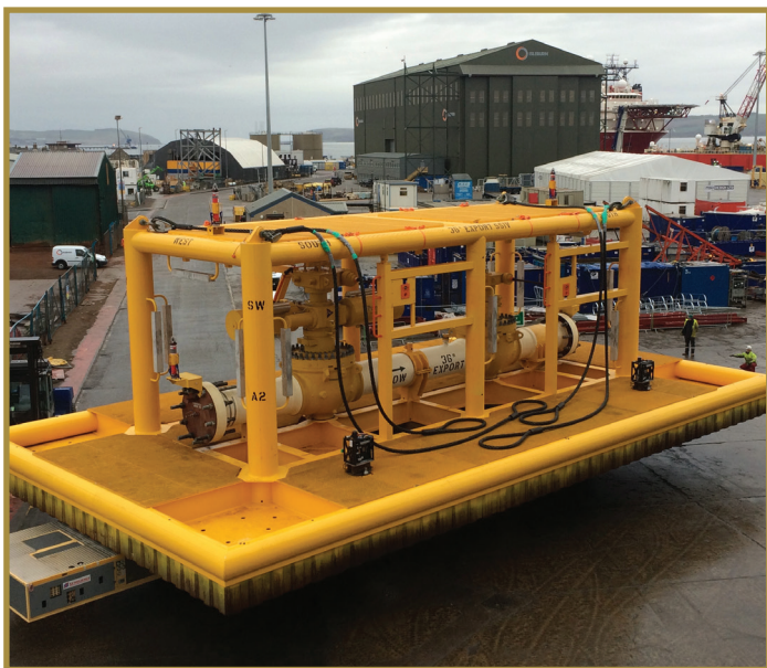
Subsea isolation valve (SSIV) prior to offshore deployment

The dual seals of the Tecno Plug™ were then independently tested with full pipeline pressure to confirm leak-tight isolation and allow the pipeline to be bled down to subsea ambient from the platform launcher to the rear of the Tecno Plug™. The annulus between the Tecno Plug™ seals is then vented to ambient to create a zero-energy zone. This was then subject to an eight hour isolation stability hold period before an 'Isolation Certificate' signed by the STATS Isolation Supervisor, client representative, Cruden Bay, and DSV could be issued. The Tecno Plug™ was then confirmed as providing double block isolation of the Forties Pipeline and allowed the subsea construction phase to commence. Two pipeline spool pieces were safely removed to allow the installation of the two metrology spools required to tie-in the pre-installed SSIV arrangement to the pipeline and the Forties Charlie platform.